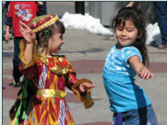
Beautiful little Tajik girls entertained the crowd with their dancing.

There was a wonderful turn-out for this year's Tajik New Year Celebration in March. The weather was very nice for the first day of spring and everyone enjoyed the festivities. Men, women and children came in traditional dress.