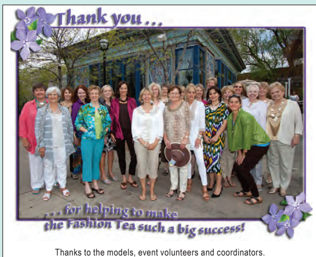
Thanks to the models, event volunteers and coordinators.