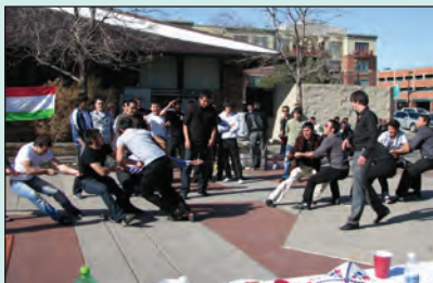
Tug-of-War contest between some of the Tajik men.

A big thank you to everyone who helped with the event, the Denver area Tajiks and the Boulder-Dushanbe Teahouse staff.