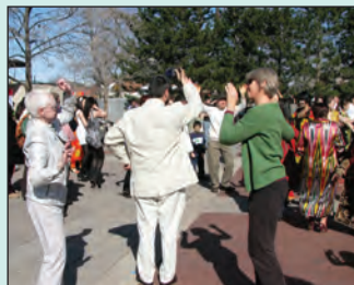
Everyone enjoyed the dancing!